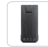
Battery 2000mAh BL2021