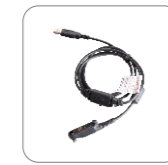
Programming cable PC155