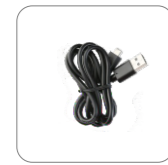
Data cable PC143