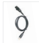
Programming Cable (USB Port)