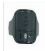
Wireless Finger PTT