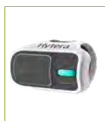
Wireless Ring PTT