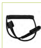
RVM to PDC/PTC series Cable RVM to PD7/9 series Cable RVM to X1/Z1 series Cable